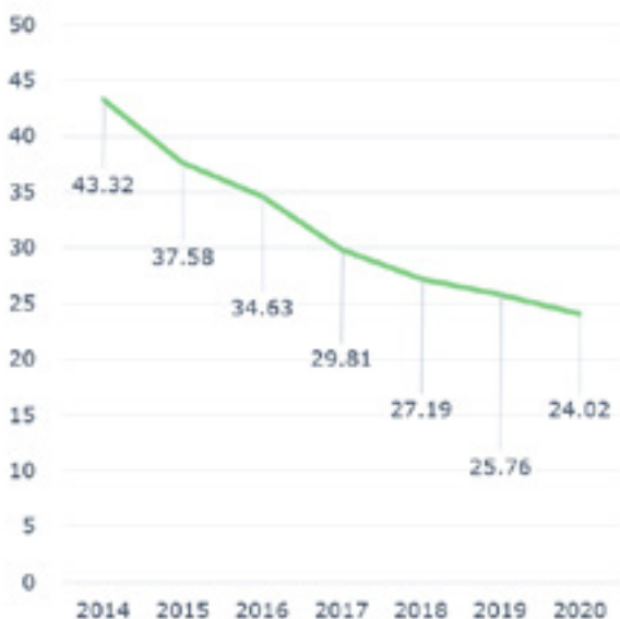
Average amount of overtime hours (according to openwork)

This all resulted in a constant shrinking of Japan's population: If people are too busy with work, they have no time to raise a family. Since 2005, Japan's population began to decrease, with the number of deaths exceeding the number of births, and a rapidly falling birth-rate.